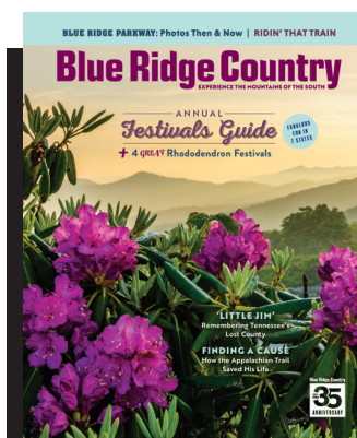
MAY/JUNE 2023 COVER

Also mailed to EVERY Blue Ridge Country magazine subscriber in the May/June issue.